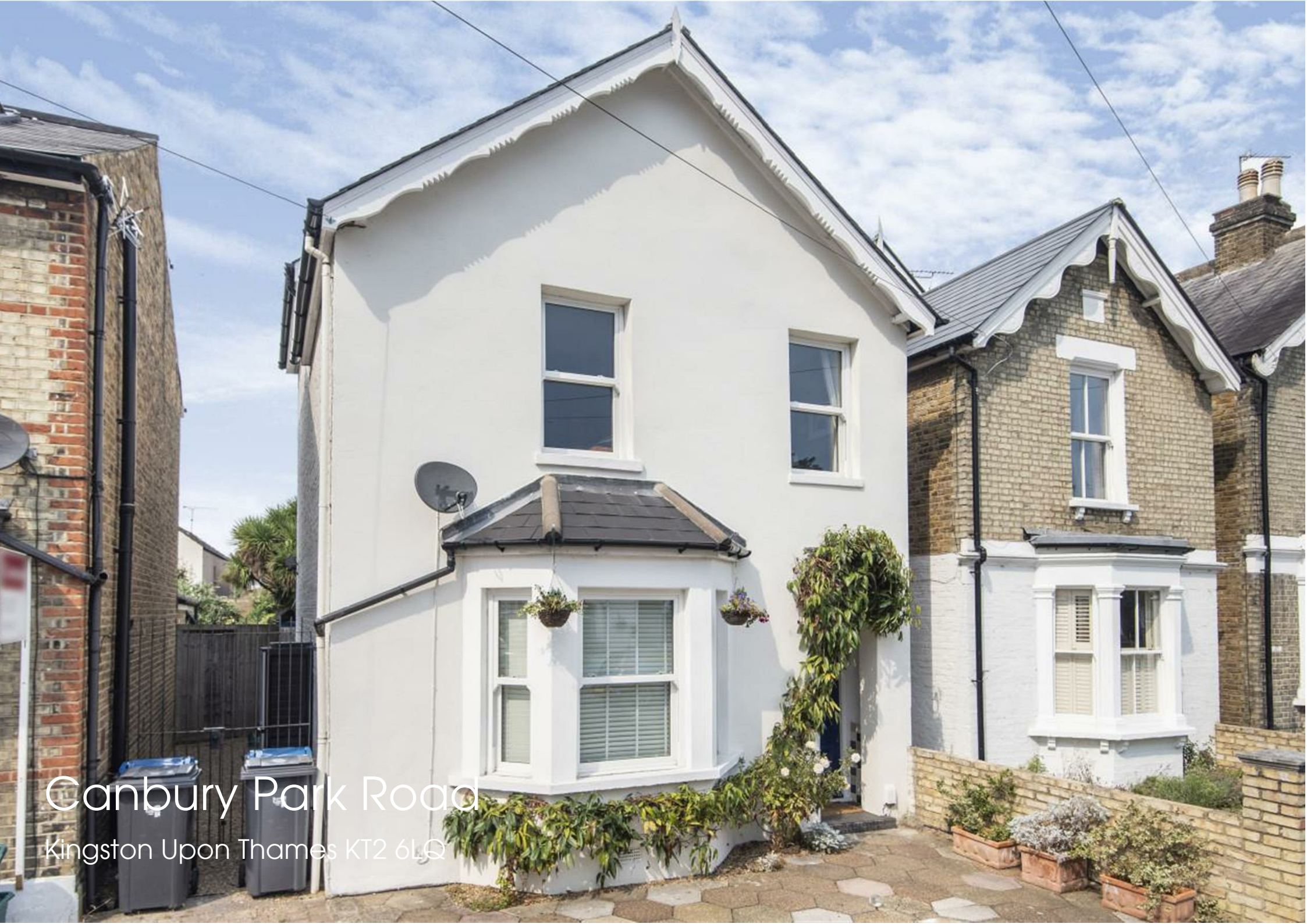
Canbury Park Road Kingston Upon Thames KT2 6LQ